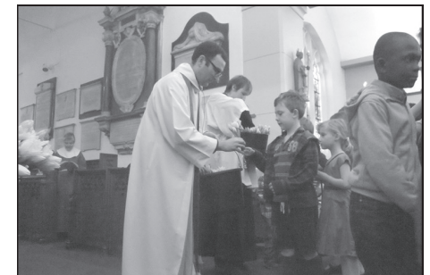
Mothering Sunday Parade Service, full article page two