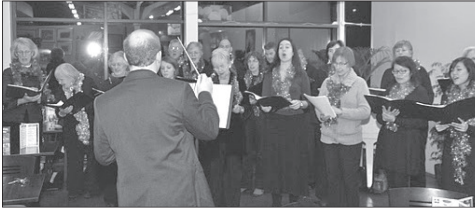
St Mary's Singers singing Christmas Carols for early evening shoppers & cafe customers at Squires Garden Centre on 1st December